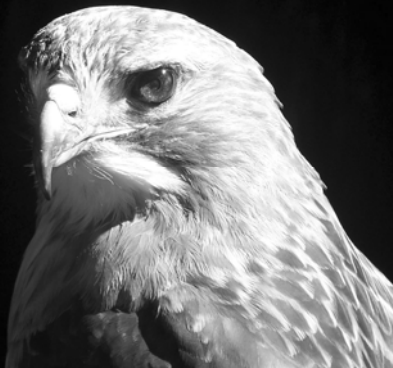
Annie the Red-tailed Hawk

Earlier this spring, the WVRRC decided to keep a permanently-injured red-phase Eastern Screech-owl to use in educational programs. The owl's name—"Rusty"—is the result of a contest held at Kids' Day in Morgantown. Look for Rusty and loft-mate Otus at educational programs and events this fall! And, look for a photo of him in the next issue of The Falcon — he's molting right now, so we thought we'd wait to take his debut picture until he was a bit more handsome!