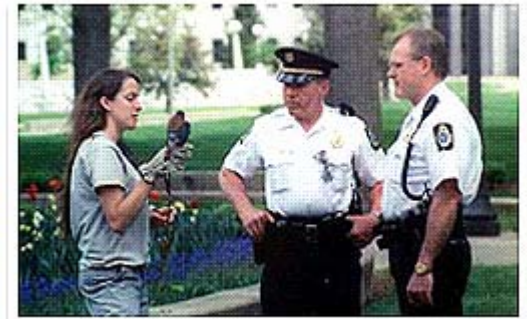
Spyro meets some of Charleston's finest outside the state capitol, circa 2003

Even though he could sometimes be a little monster to work with, Spyro soon became popular with the volunteers. When he first came to the Center, we didn't have an appropriate permanent outside flight cage for him, so we held special work-days to build one. Several volunteers went above and beyond the call of duty to cut boards, dig post holes, stretch and staple netting, and construct a special set of perches for Spyro's new home. It was hard work, but when the cage was finished, seeing Spyro living in it was well worth the effort—his favorite spot to sit was inside (or on top of) his roosting box, where he could look into the woods and at the other birds outside, frequently bobbing his long tail.