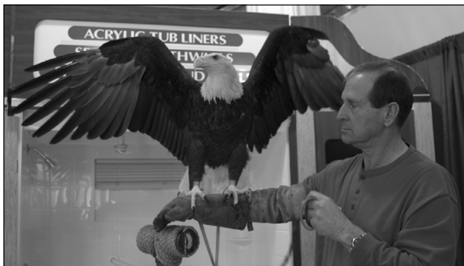
Thunder and Mike at a recent educational program

If all goes well, a bald eagle pair may mate for life, although there is little hard evidence to verify this belief. The female will lay 1-3 eggs that will be incubated for 35 days. It will then take 10-13 weeks to fledge and about another month for final weaning/honing of hunting skills. Depending on food supplies, these mating pairs will require from 18,000 to 180,000 acres to call their home range.