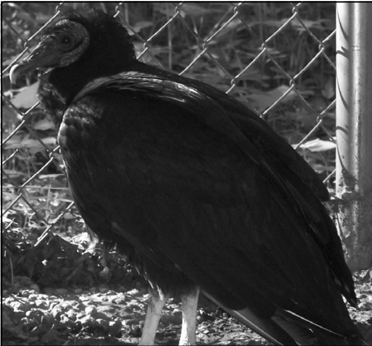
This Black Vulture is recovering from a leg injury. The bird is currently housed in one of our large outdoor flight cages for exercise.

PARENT receives an adoption certificate and the WVRRC newsletter. STEWARD receives a photograph of the sponsored bird, an adoption certificate, and newsletter. CARETAKER is entitled to be photographed with the adopted bird, receives an adoption certificate, and newsletter.